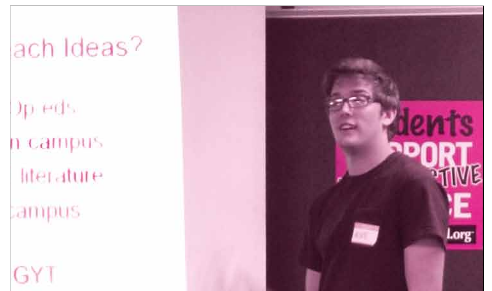
Student leaders participate in team-building exercises and sex ed presentation training.