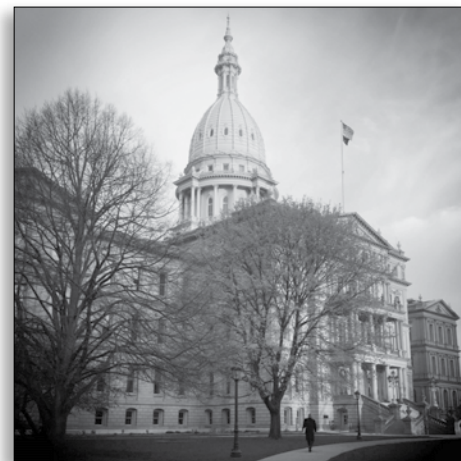
Michigan State Capitol