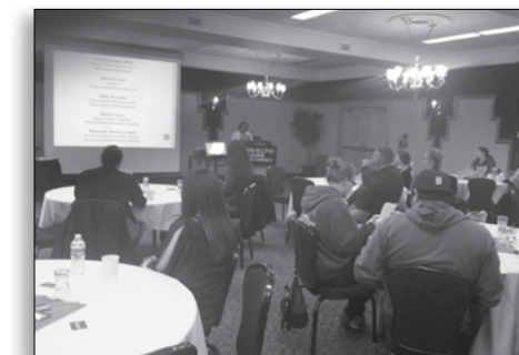
Campus tour participants learned how the Affordable Care Act affects women and communities of color.